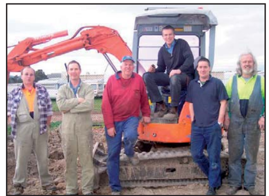
Our in-house drainage team